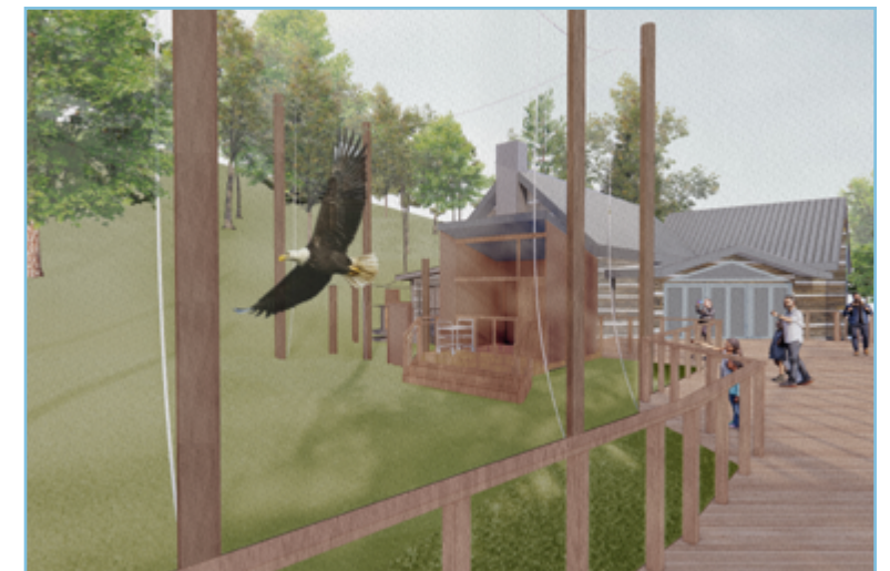
Flighted exercise enclosure