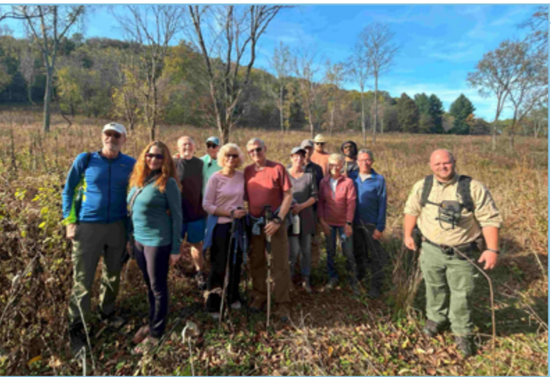
Native Grasslands Hike through the Hall Farm. Photo by Steve Ward

One of the recurring themes of these hikes was Radnor Lake’s Native Grassland Initiative, a project aimed at restoring habitats for indigenous birds, butterflies, and other wildlife. Monarch butterflies, in particular, depend on milkweed and other native plants to thrive. During hikes like those we hosted on November 4th and 15th through the Hall Farm, volunteers were given a chance to learn about the important role these grasslands play in the ecosystem. On our November 20th volunteer day with HCA Healthcare, over 35 volunteers worked tirelessly to remove invasive species and clean up trash along Franklin Road, ensuring the success of these grasslands.