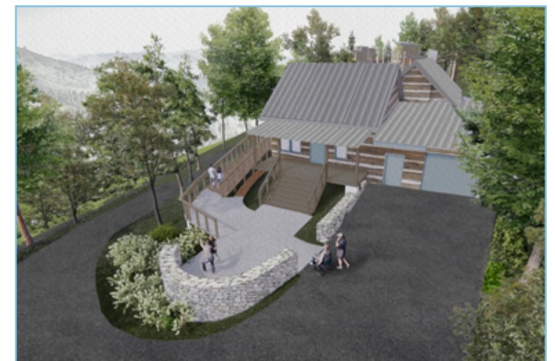
Universal access to boardwalk