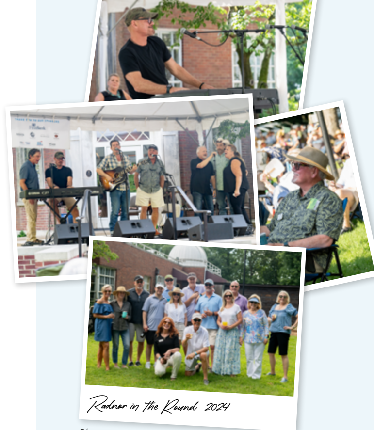
Radnor in the Round 2024

Tickets go on sale Thursday, August 21 at RadnorLake.org/radnor-in-the-round-2025 $325 per Carload