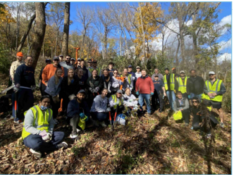
HCA Healthcare Volunteer Day at the Harris Ridge Trail Project.