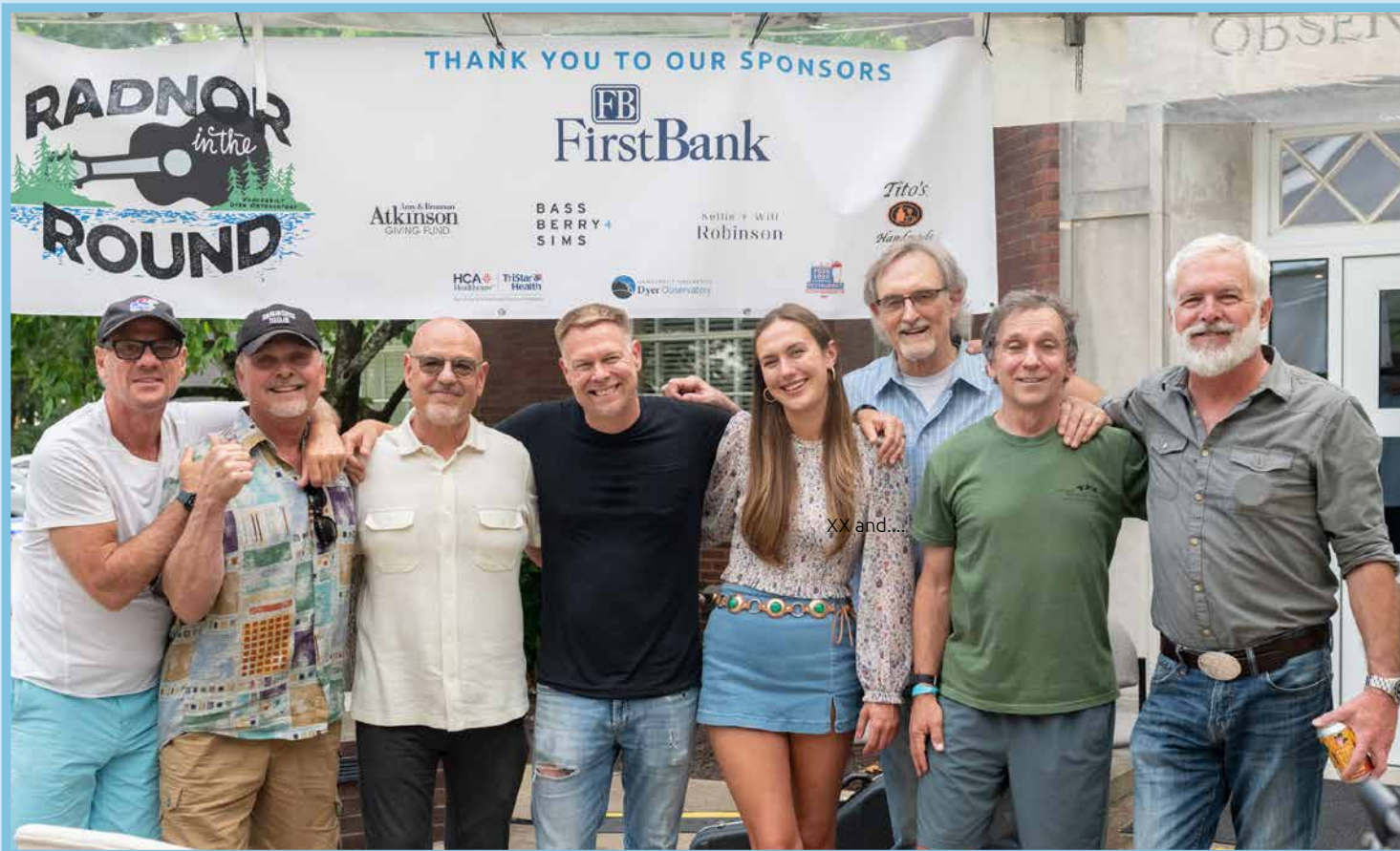
2023 Radnor in the Round artists