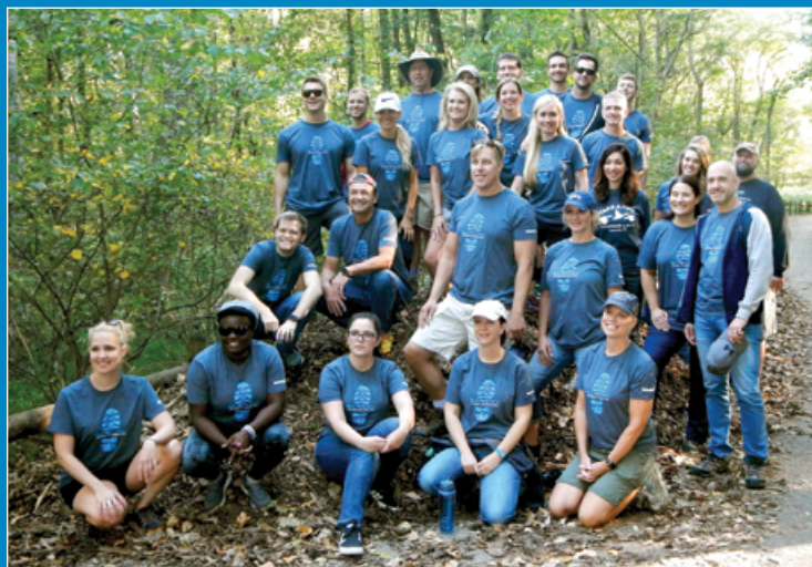
Nissan Green Team Volunteers support National Public Lands Day at Radnor Lake.