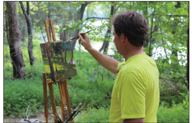
Chestnut Group artist paints on the trails at Radnor Lake.

Thanks to our neighbor, Strong Tower Bible Church, free parking and shuttle service will be available Saturday and Sunday. Details at RadnorLake.org