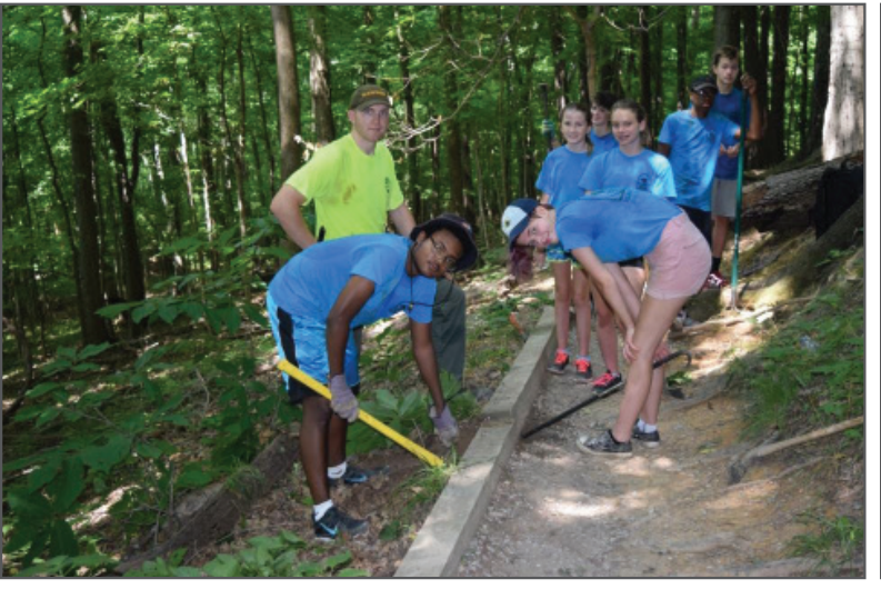
Interns spend four days working on trail projects at Radnor Lake State Natural Area with the park ranger staff, improving the trail system for our 1+ million annual visitor.

Internship sessions include a river cleanup day, where tires and countless bags of trash are collected from the river. Thanks to FORL Board Member Greer Tidwell, in the past four years over 150 tires have been recycled through the Bridgestone Americas Tires4ward Program.