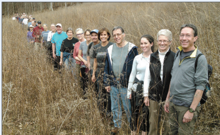
Ranger-led After-Thanksgiving Hike, Nov. 2015