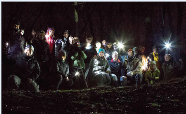
2014 New Year's Eve Hike was a blast!

Starting on New Year's Eve, ranger staff will be leading a series of hikes to the planned 52-acre land acquisition site at Radnor Lake State Natural Area. Enjoy the view, learn about the watershed and viewshed at Radnor Lake and the historical and natural features of the property. For more information and to sign up for special hikes, visit radnorlake.org or call the park office at (615) 373-3467.