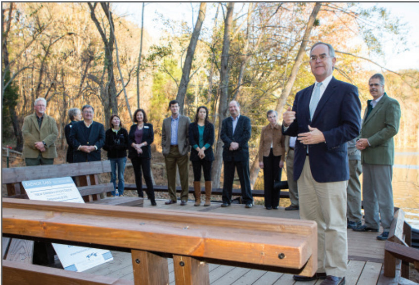
Congressman Jim Cooper speaking at the special park event where this historic land acquisition was announced.