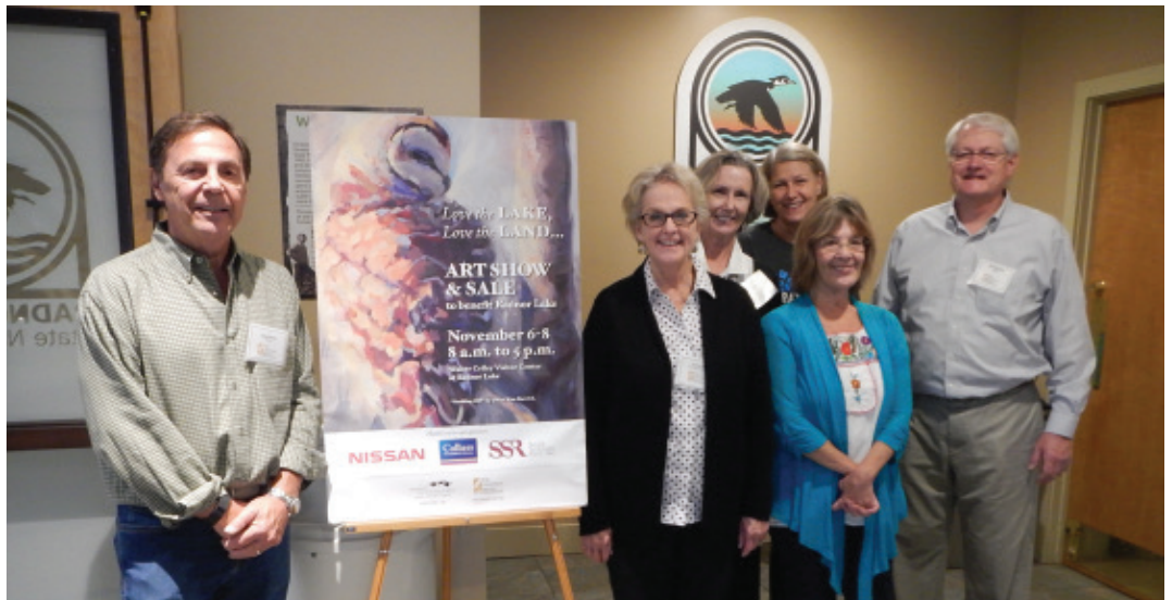
Thank you Chestnut Group!