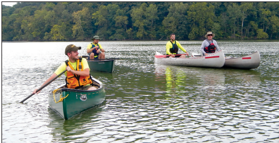
Ranger staff in canoe instructor class