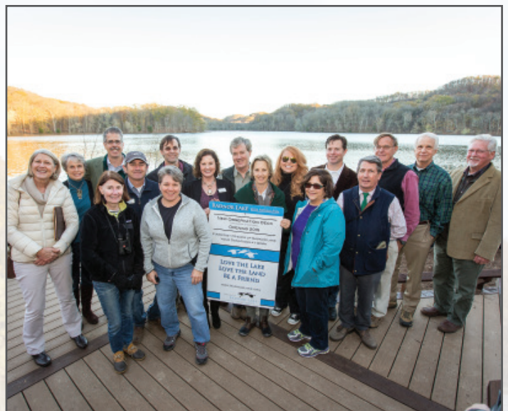
Friends of Radnor Lake board members.