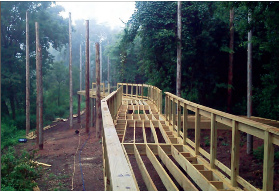
A boardwalk is under construction from the education center on Hall Rd. to the aviary.