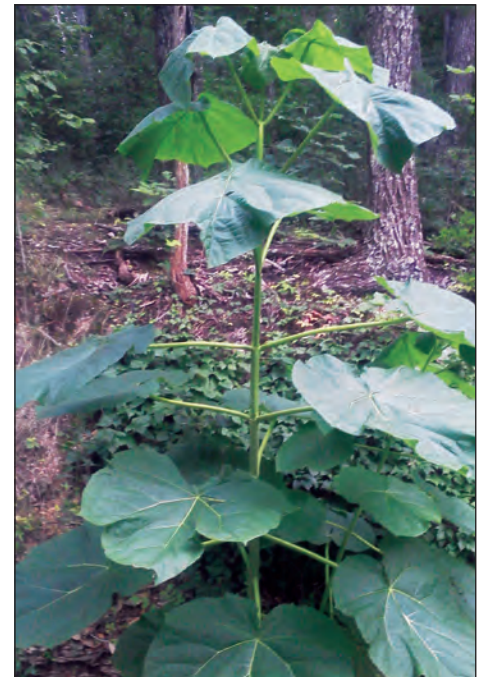
Invasive-exotic plants: bush honeysuckle (left) and a new shoot from the Princess Tree (right) grows aggressively.