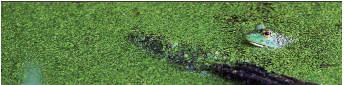
A contented bullfrog peeping out of the duckweed.

Special thanks to the two private donors whose donations made this project possible and to Access Control Systems LLC for its generous in-kind contribution and professional installation of the system.