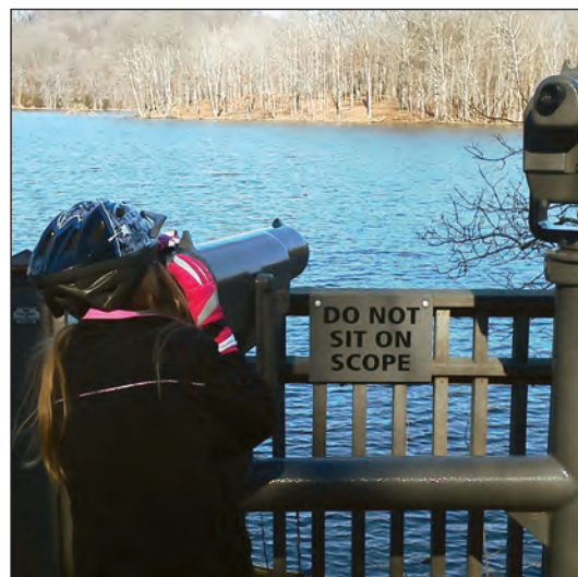
A young visitor uses scope to view migratory waterfowl.

In addition, Friends of Radnor Lake and Imagen, LCC partnered on this project contributing additional funds to allow us to maximize on the grant awarded to us by the Maddox Charitable Fund.